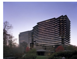
Two Ravinia Drive