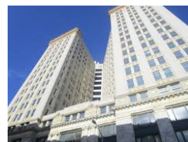
The Hurt Building