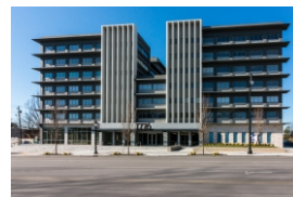
1776 Peachtree Street