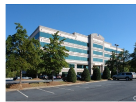
Mansell One & Two