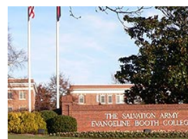
The Salvation Army